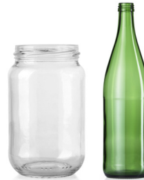
GLASS BOTTLES & JARS (Green, Brown, Clear)