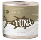
ALUMINUM and STEEL CANS