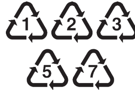
PLASTIC (Clear or Colored*) Label #s 1, 2, 3, 5 & 7