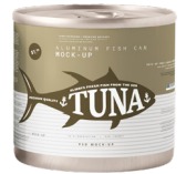
ALUMINUM and STEEL CANS