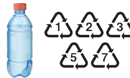
PLASTIC (Clear or Colored*) Label #s 1, 2, 3, 5 & 7

NOTE: Items must be clean, with non-paper items rinsed and labels removed.